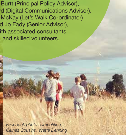
Facebook photo competition Clunes Cousins, Yvette Denning