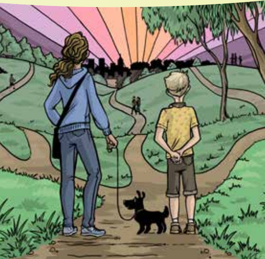
Illustration by Elena Strelnikova

This report summarises Victoria Walks' activities and highlights from 1 July 2018 to 30 June 2019.