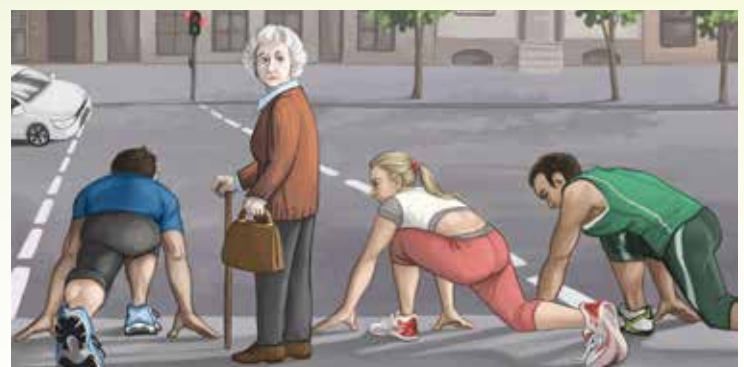
Illustration by Elena Strelnikova